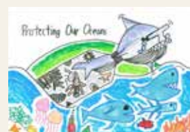
Yiwei Xia's (Year 1) goal for environmental care was beautifully illustrated with the title, "Protecting Our Oceans".