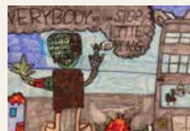
Travis Guo's (Year 2) artwork invites positive action, "Everybody we can stop littering".